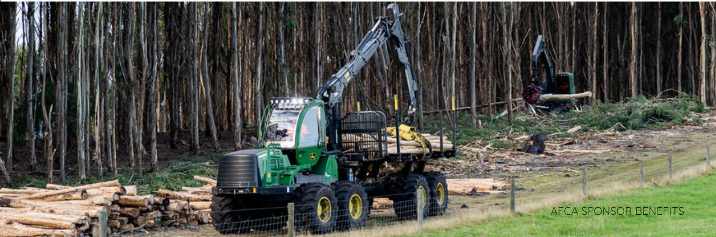
AFCA SPONSOR BENEFITS